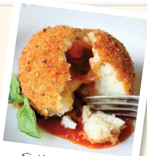
Sicilian Rice Balls